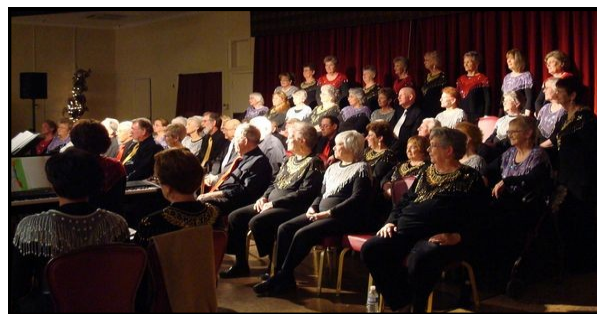
Community Chorus entertains at our December Dinner Meeting.